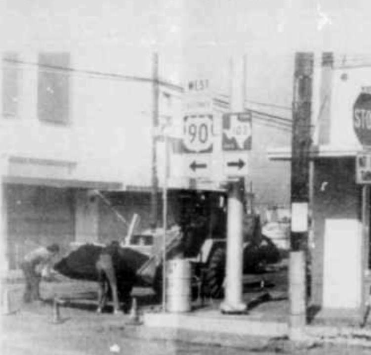
That bump you should remember if you ever drove down West Main street has disappeared. Last week city crews graded the bump in the concrete and filled the hole with asphalt. The work was just one of the many improvements which have been made in city streets in conjunction with the street program approved by voters a year ago.