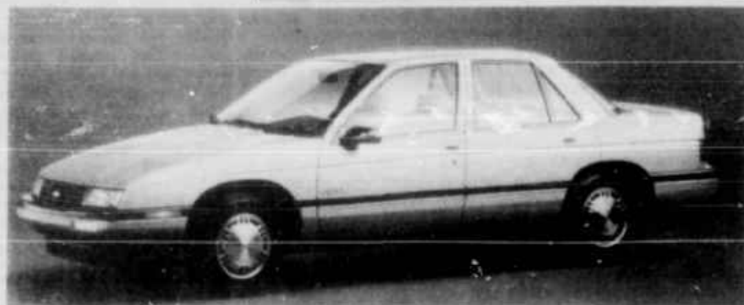
1988 Chevrolet Corsica