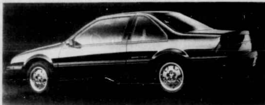
1988 Chevrolet Beretta

Corsica and Beretta Are The Ultimate Compact Cars on Display Beginning Thursday, March 12